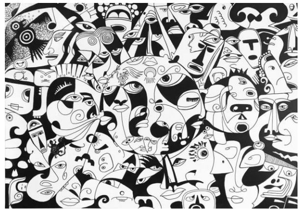
2- The Sun - Ancient Mayans