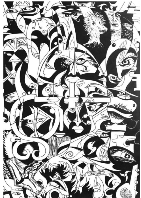
5- The Present - Vikings

I tend to let the making process find its own way to resolution whilst maintaining a reasonable control over the core element of the design- that I usually embed it, as the combined elements and direction of the piece make way for something previously unknown or unexpected to come through.