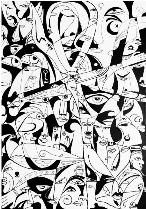
4- The Life - Ancient Egypt

Collage and the manipulation of pre-existing elements is a method of working that I find compelling, satisfying and often surprising. The process of moving from found elements, through various permutations of trial and error and association and integration between the chosen elements, allows freedom of play and discovery that feels endless, despite its seeming inbuilt limitation.