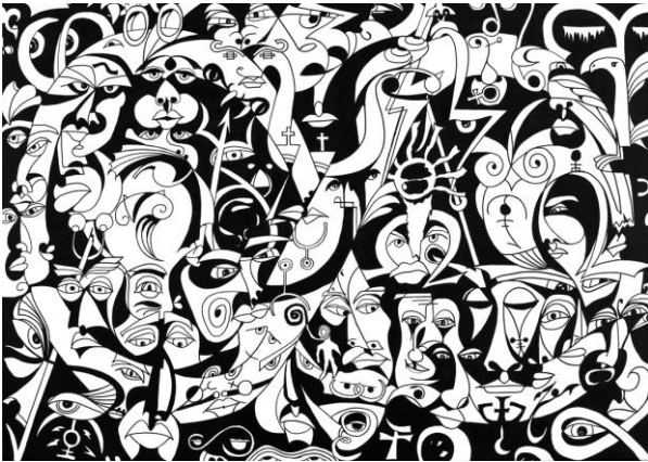
1- The Infinity - Ancient Greece

My work is my reflection on symbols, signs, characters and other symbolic elements of ancient cultures. I research a particular culture first, then pick those elements I wish to use in the artwork, add my own taste to the element, add my own elements that are mainly inspired by cubism, make the design then complete the painting. My works are mostly black and white.