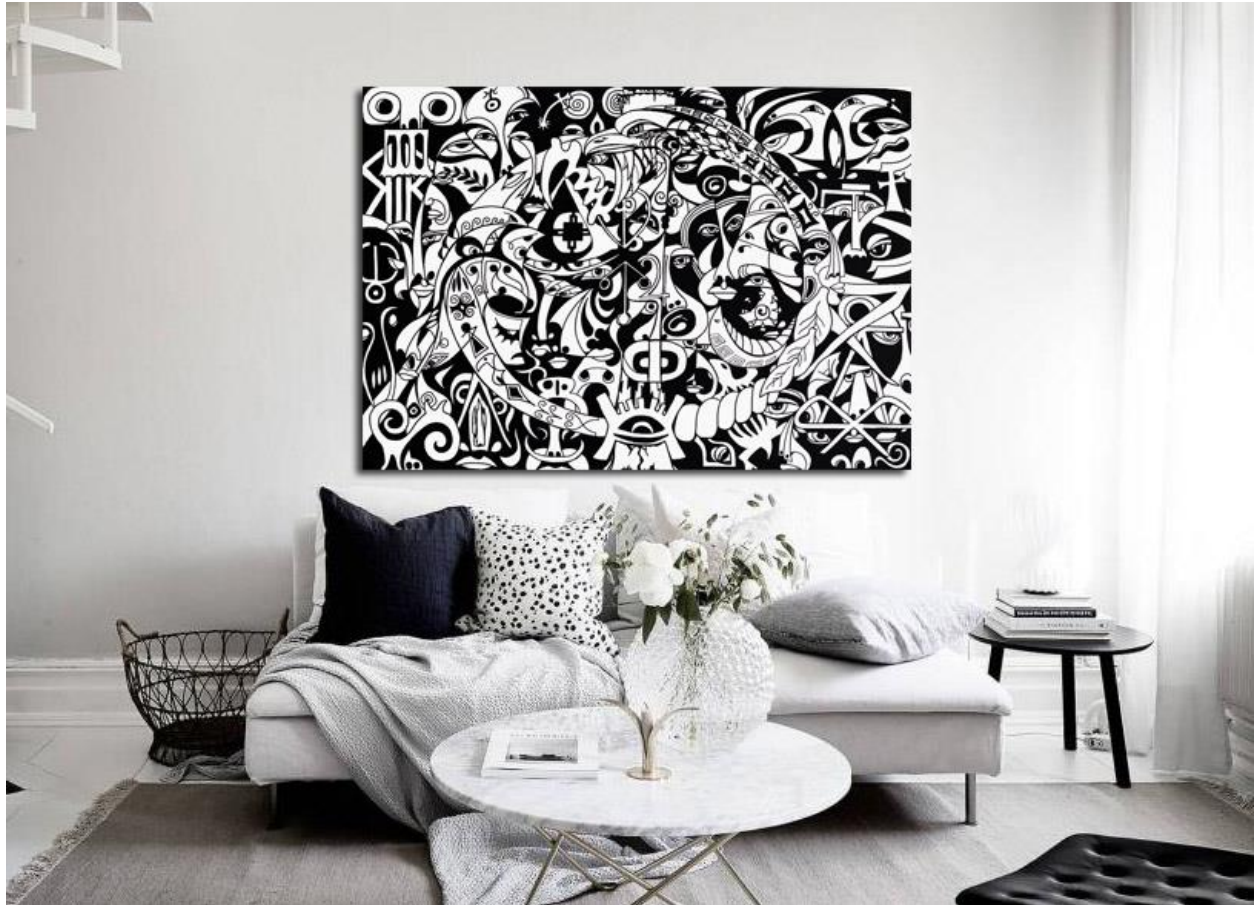
6- The Earth - Ancient Romans